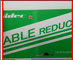
ILLUSTRATION OF THE PROBLEM