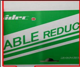
ILLUSTRATION OF THE PROBLEM